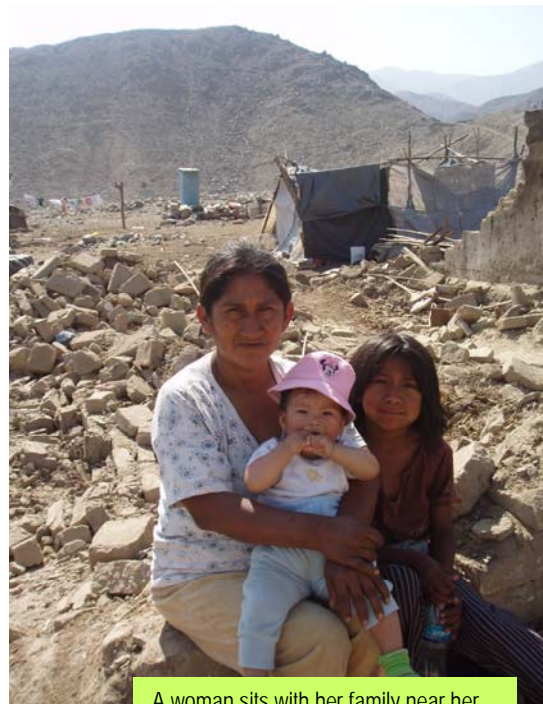
A woman sits with her family near her destroyed home in San Jose.

CHF International responded rapidly to the emergency in Peru. By August 20, 2007, CHF's Emergency Response Team (CERT) was on the ground, identifying those communities most in need and underserved by other responding agencies. The CERT quickly made contact in San Jose de Los Molinos and Parcona, two mountain towns that had long been left out of the development process in Peru. Working closely with community members and leaders—80% of whose homes had been seriously damaged--the next step was to immediately identify priority interventions in order to most effectively provide relief to the communities affected.