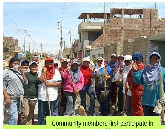
Community members first participate in rubble clean-up activities.

Households actively participated in construction activities by providing labor, while CHF provided basic construction training, construction materials, and tools. This approach ensured that affected people were actively engaged in their own recovery efforts, and learned new skills that they could use to help their neighbors. To start, households removed debris from each building lot, salvaging materials such as doors, windows, wood, and adobe bricks to reuse in the new shelters. This technique helps families feel more at home in their shelter. Each household allocated one member to participate in the construction of the shelter. Activities were