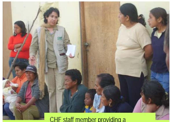
CHF staff member providing a community training.

Throughout, CHF also maintained close relations with local government stakeholders. Meaningful involvement of local authorities reinforced transparency and democracy while empowering beneficiaries as they become more familiar with local and national government decision-making processes.