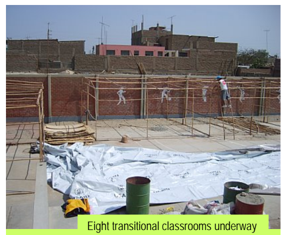
Eight transitional classrooms underway for a destroyed elementary school.