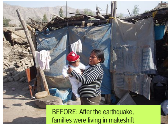
BEFORE: After the earthquake, families were living in makeshift shelters that were unstable and dangerous.

Similarly a daycare center , also destroyed by the earthquake, was rebuilt using the shelter model to provide interim space while the daycare center is rebuilt. In addition, CHF found that in this region of Peru households have traditionally pooled their weekly foodstuffs to create communal meals. Their communal dining areas serve as community centers, a space where neighbors gather to share news, discuss problems, and find solutions to