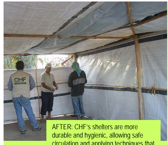
AFTER: CHF's shelters are more durable and hygienic, allowing safe circulation and applying techniques that are locally appropriate.