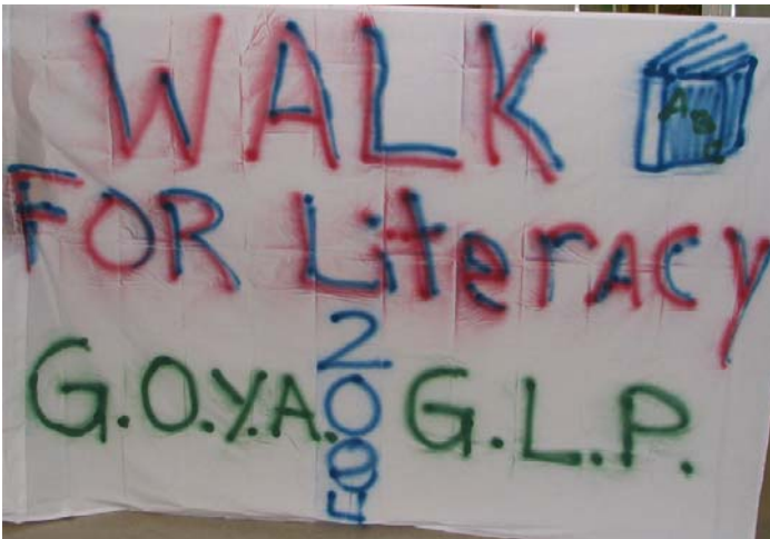
One of the banners completed!!