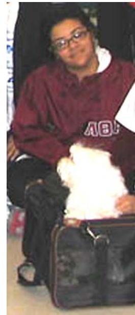
Several Lambda Theta Alpha members supported the walk