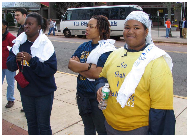
Members of Alpha Nu Omega