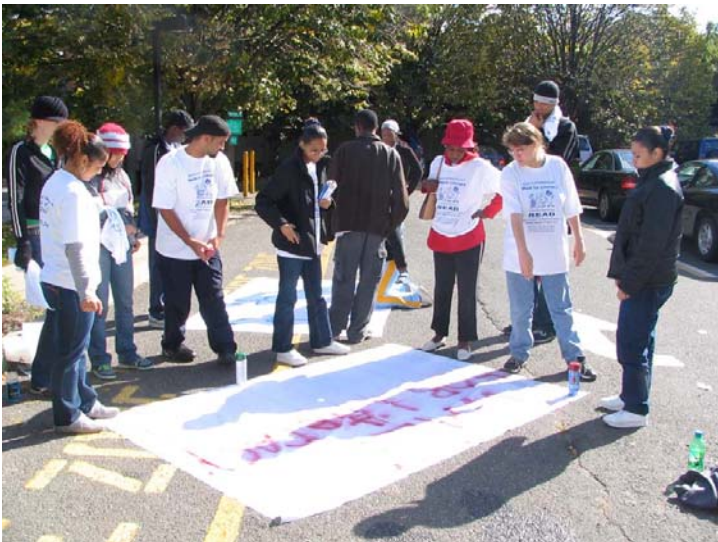
Walkers debating design of one of the banners