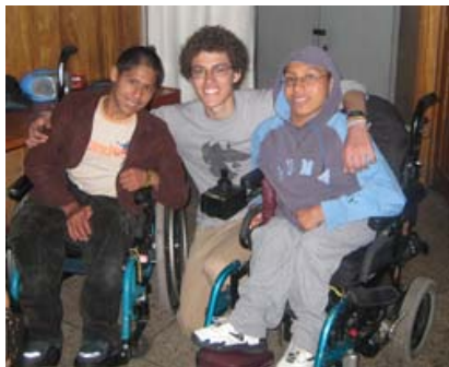
Volunteering in Brazil during the Spring 2008 semester

Our volunteers have worked on projects including “Habitat for Humanity,” Elijah’s Promise (outreach to the homeless), Women Aware and many other charities. The projects selected by GOYA stimulate participants to link what they study at the university as part of their general education with what happens in the wider world beyond the university.