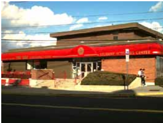
The Student Activities Center (SAC) ( http://www.rc.rutgers.edu/centers/sac/centers_sac.html )

Located next to the River Dorms. The Rutgers University Buses also stop at the center. Our mailbox is SAC Box #4.