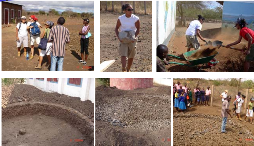
Foundation dug to 4ft deep