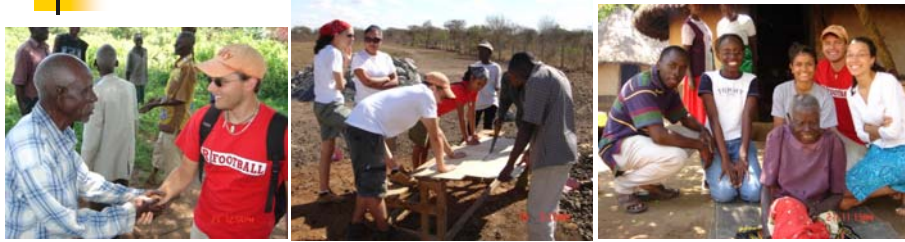
Project Costs Sponsored by Fountain Baptist Church, Summit, New Jersey

Report Prepared by the Global Literacy Project, Inc. ( http://glpinc.org/ ) - © 2006 Global Literacy Project